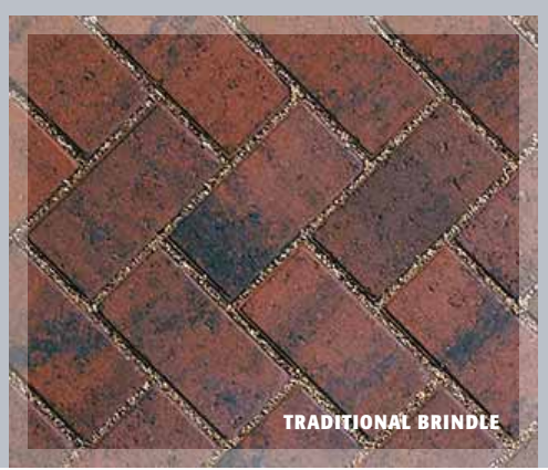
Plaspave Permi.8 Paving - the PERFECT